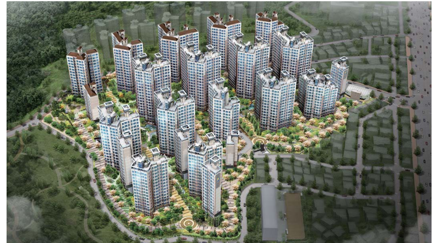
● Emco Town (Central Park) in Sangdo-Dong, Seoul

● Emco Town (Ashton Park) in Sangdo-Dong, Seoul