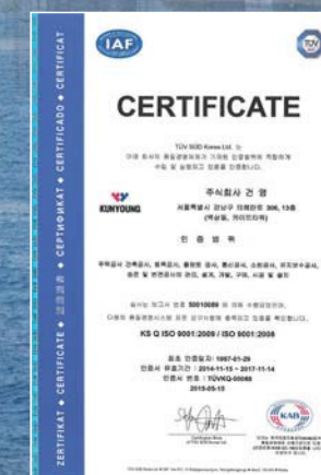
● ISO 9001 CERTIFICATE