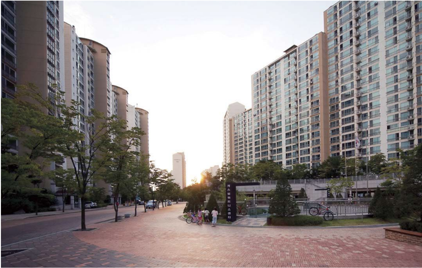
● Yongin-Jukjeon Casvill Apartment