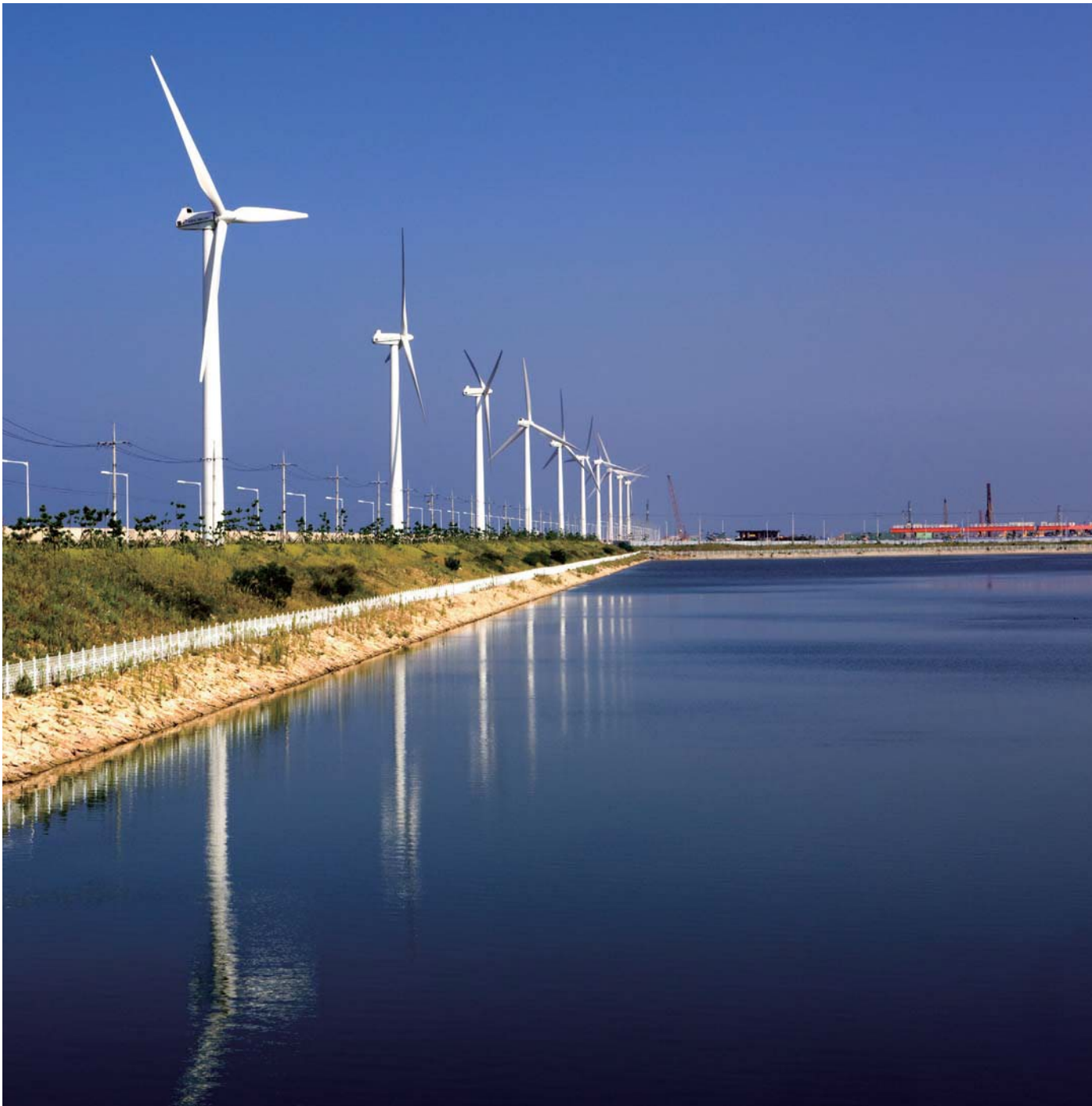
● Wind Power Generation

Sculpting a clean and transparent environment We utilize our optimal design and construction capabilities in deriving environmental solutions to deliver cleaner and more sustainable living environments by effectively preventing and managing pollutants. It takes much effort to purify exhaust air for industrial sites and to provide more efficient and economical waste water treatment solutions. KUNYOUNG leads the evolution of air purification systems and waste water treatment systems.