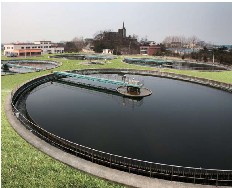
● Sewage Treatment Plant in Ilsan