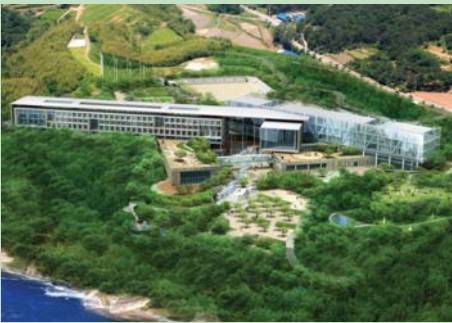
● LIG HR Center Geothermal System

KUNYOUNG promotes the practical use of natural energy sources such as solar energy, wind power and geothermal energy and we relentlessly seek solutions to solve the underlying reasons for pollution. Furthermore, we teamed up with enterprises specializing in environmental business in order to protect nature and natural resources that are being drained and to effectively purify the polluted environment. We are able to deliver greater results through our all-inclusive environmental service that integrates research, design, construction and management of projects.