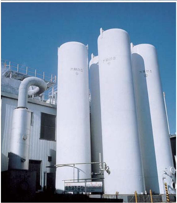
● Busan Steel Mill