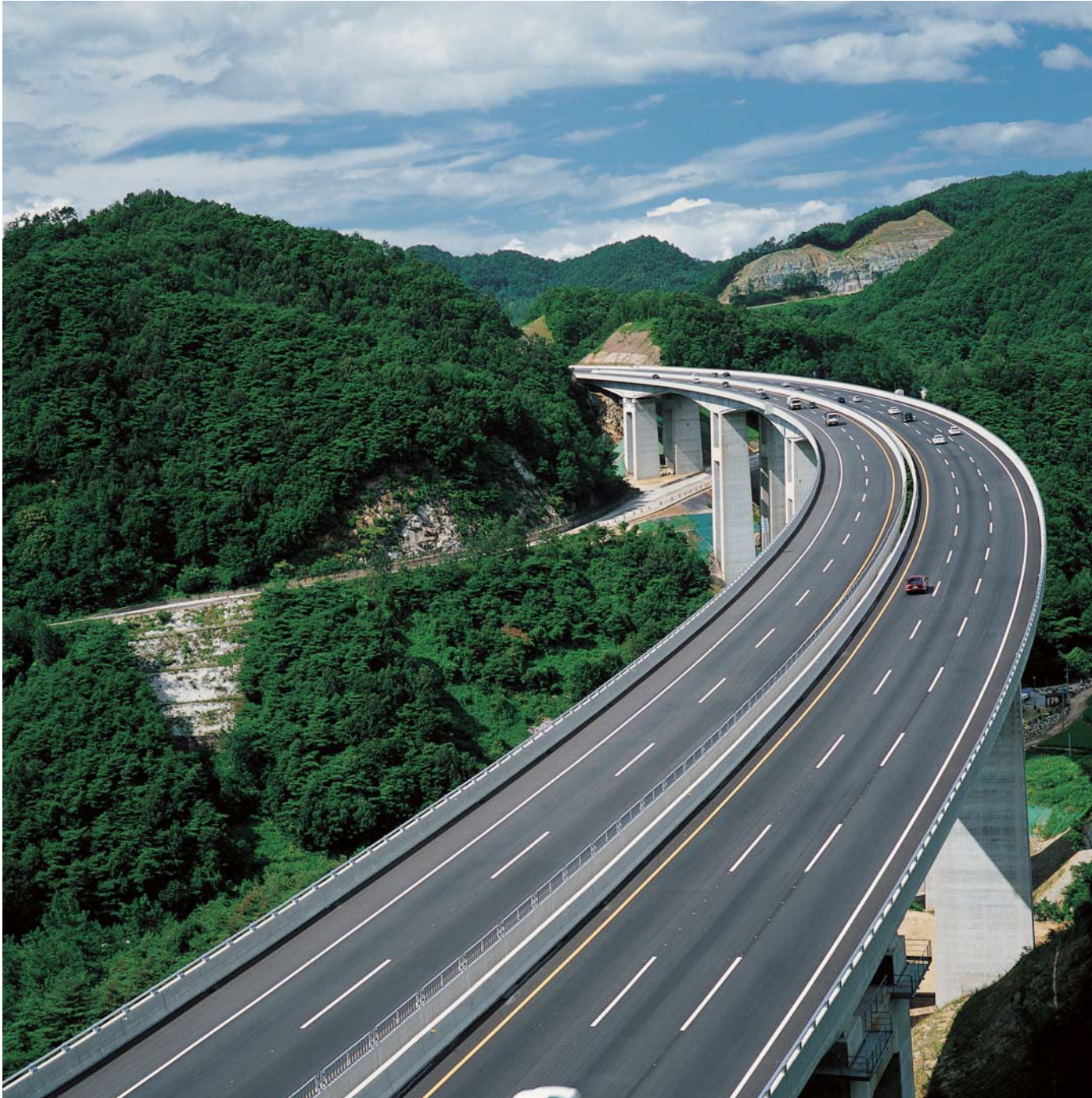
● Yeongdong Highway