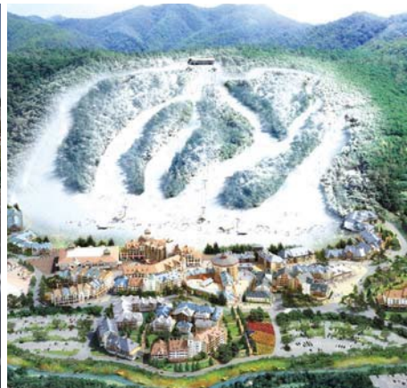
● Alpensia Geothermal System