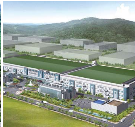
● LG Electronics Chilled Water Storage System