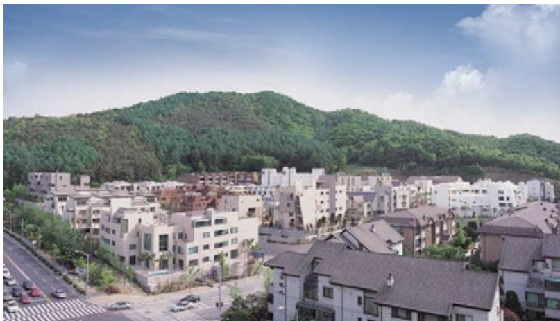
● Bundang Future Hills