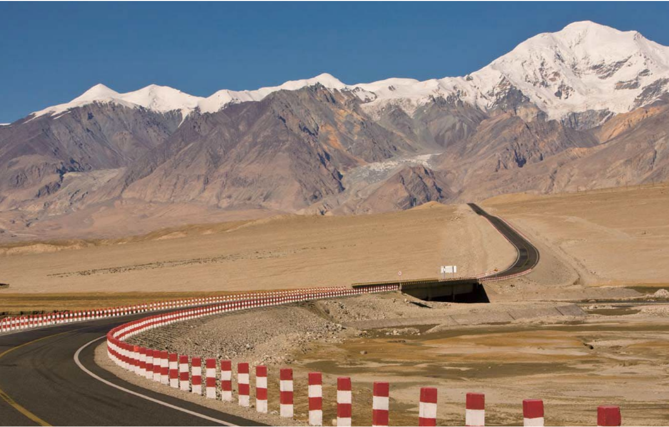
● Provincial Highway Project, Pakistan