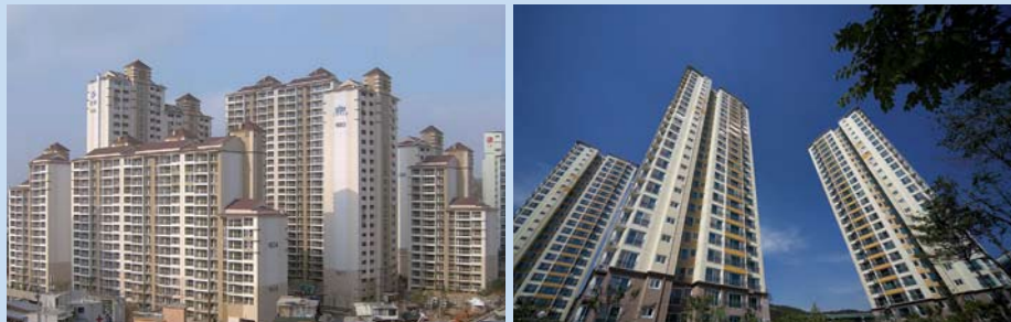
● Sangbong-dong Casvill Apartments