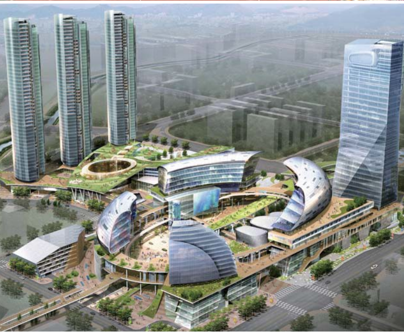
● Byeollae Mixed Use Complex