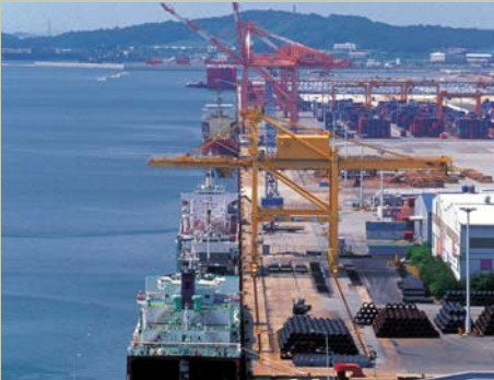
● Pyeongtaek Harbor

KUNYOUNG successfully completed various projects involving civil works and leads efficient development of national land. We have exhibited our exceptional competency in all areas of civil works and amassed expertise and experience. We are opening up a new era by increasing the value of space with our advanced technology and outstanding business performance capabilities.