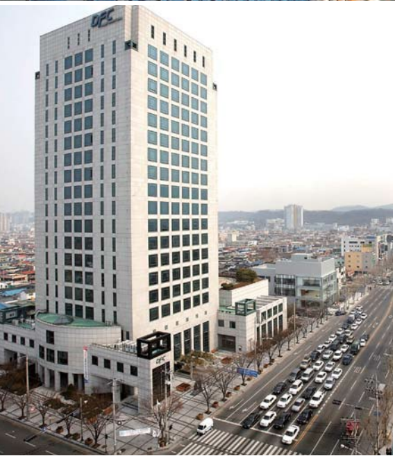
● Daedong Bank Head Office Building