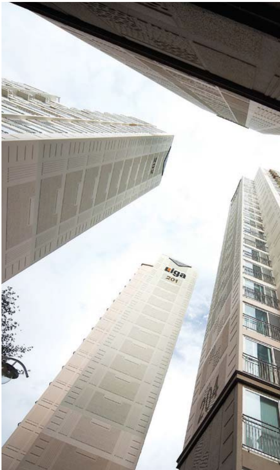
● Gocheok LIGA Apartments