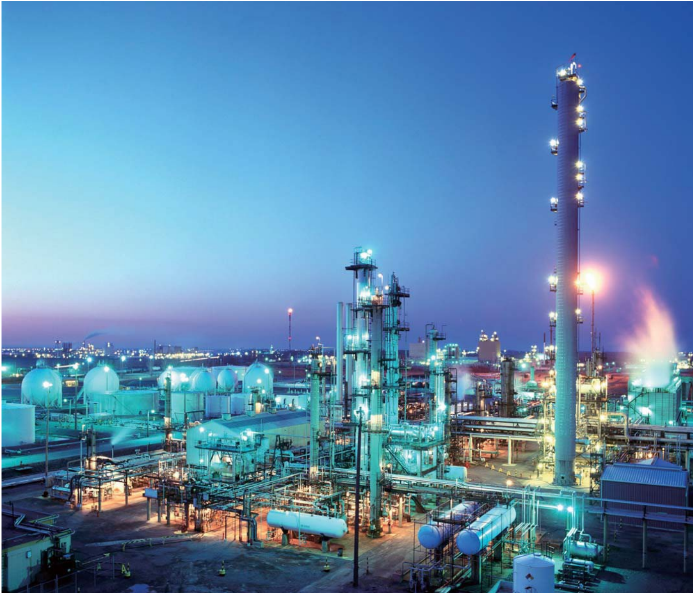
● Industrial Plant

We are forming the basis of environmental infrastructure with perfection Over the years, KUNYOUNG has played an active role in sewage treatment plants and facilities with thorough construction management, specialized technical expertise, and refined quality management. We have expanded our technical strengths into building potable water treatment facilities, seawater desalination facilities and urban infrastructure for solid waste disposal.