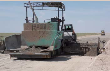
● Road Construction from Choir–Sainshand, Mongolia

KUNYOUNG constructs landmarks in new cities in the world that attract global attention with their exceptional sense of aesthetics. We are rapidly growing in the fields of civil works and plants, starting from the Middle East and Southeast Asia.