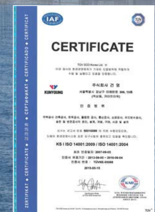
● ISO 14001 CERTIFICATE