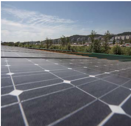
● Emart Photovoltaic System