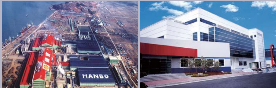
● Hanbo Steel's Factory in Asan Bay