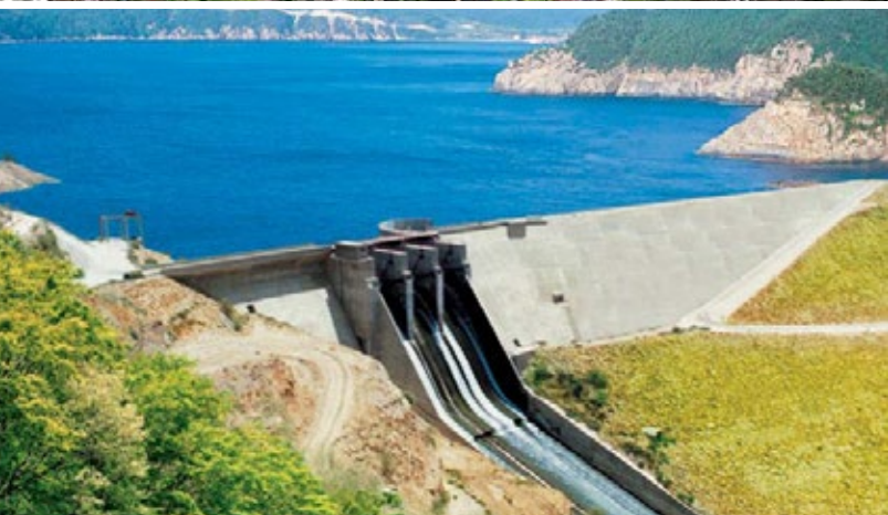
● King Talal Dam, Jordan