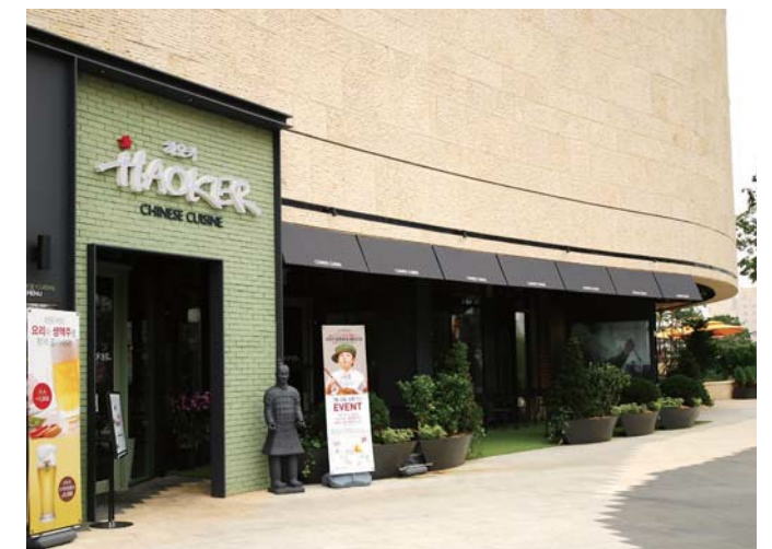
● Haoker (Hapjeong branch)