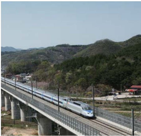
● Seoul-Busan Rapid-Transit Railway (KTX)