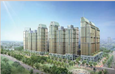
● The Mark, HCMC, Vietnam