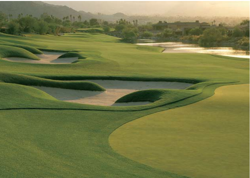
● Sangrok Resort