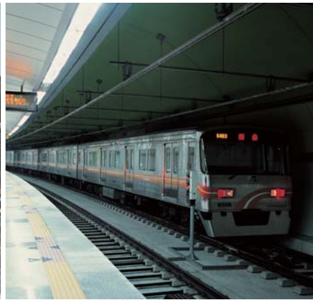
● Seoul Subway