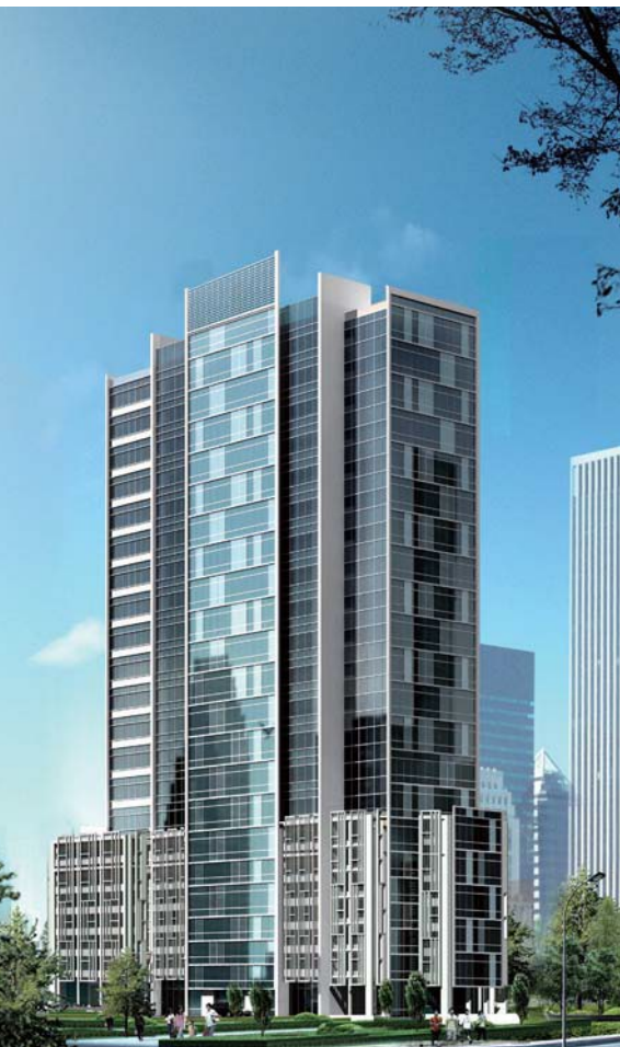
● Office Tower, Abu Dhabi, UAE