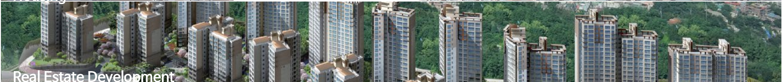
Real Estate Development