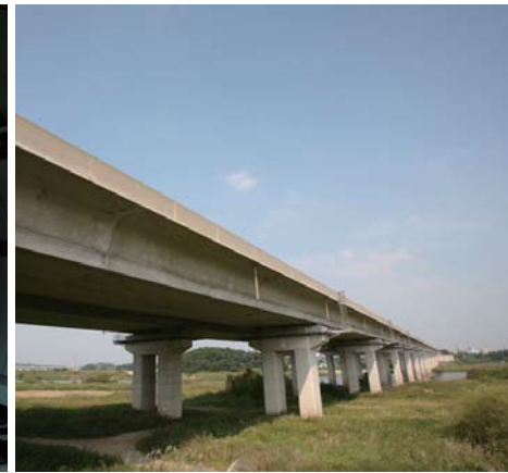
● Jinwi River Bridge